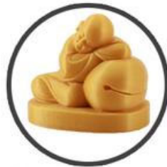
PLA Yellow gold